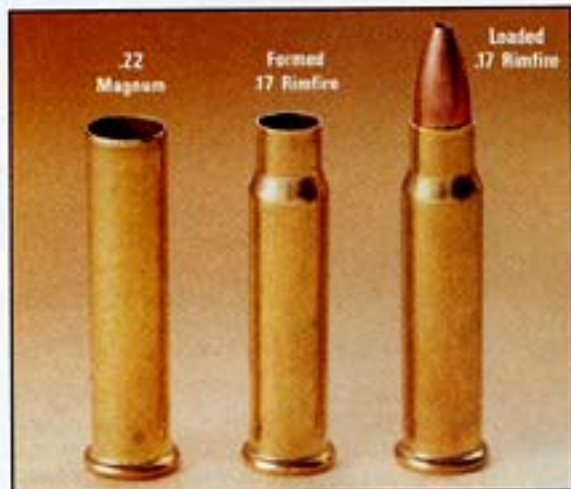
.17 Rimfire ammo is made from primed, necked-down .22 Magnum cases.